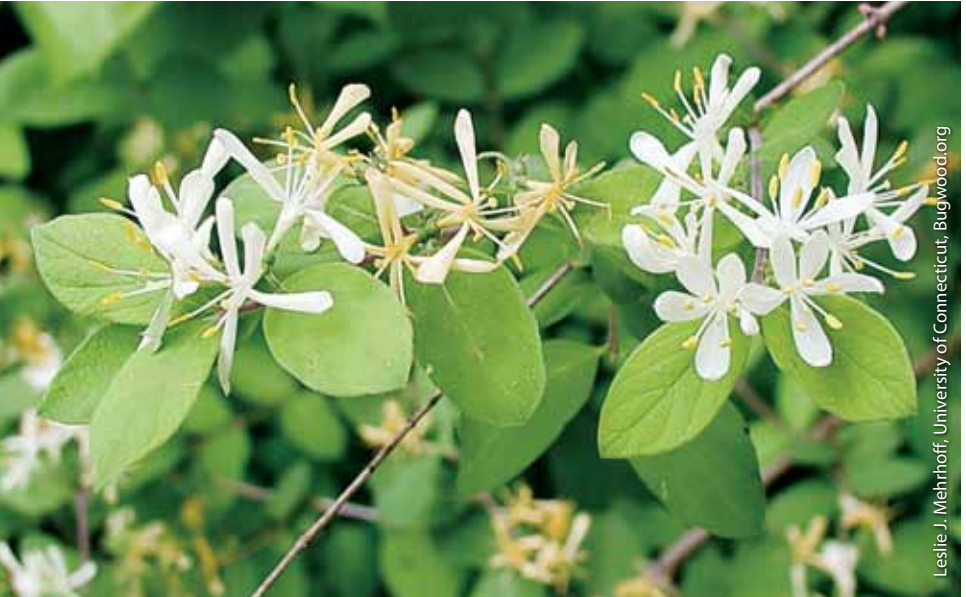
Bush honeysuckles leaf out early in the spring and block sunlight from native plants. Fragrant white flowers become yellowish as the plant matures.