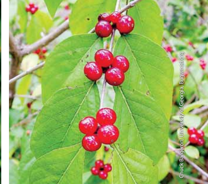
The berries, which form in pairs, do not provide the nutritional needs of migrating birds.

the fruits of exotic bush honeysuckles are carbohydraterich and do not provide migrating birds with the high-fat content needed for long flights.